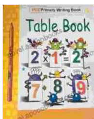
Table book: Number book (03 3) by Patience Agbabi

Patience Agbabi's Table Book Number 03 is an extraordinary literary creation that weaves together the threads of identity, memory, and the intricacies of the human experience. This captivating work is a testament to the power of language and the profound impact of art in shaping our understanding of ourselves and the world around us.