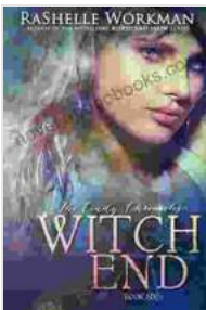
Image Alt Attribute: Cindy Chronicles Volume Six book cover featuring a vibrant and confident woman, symbolizing the transformative journey of self-discovery and empowerment.