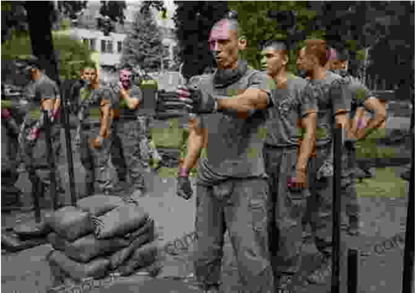
Members of the Azov Battalion training in Ukraine.