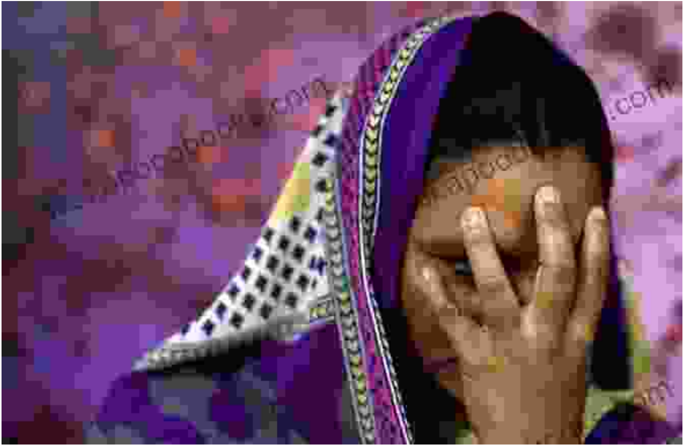
A survivor of slavery in Qatar