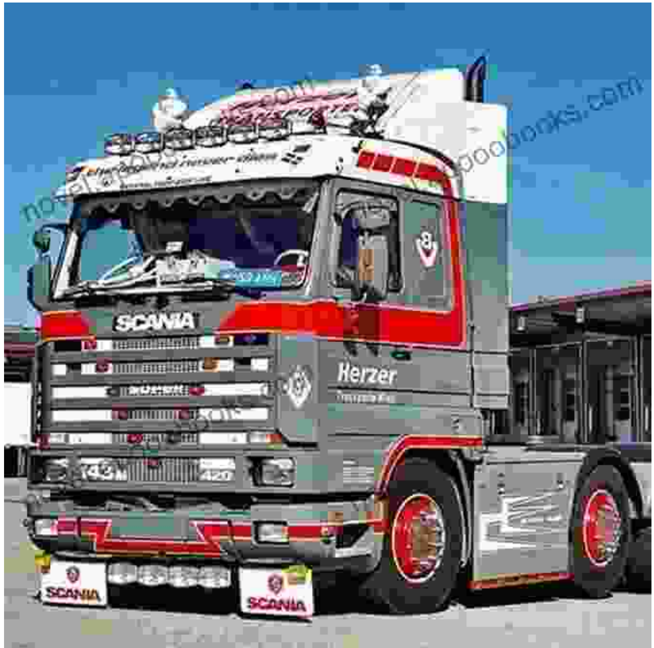
Scania 113 and 143 trucks in a construction site