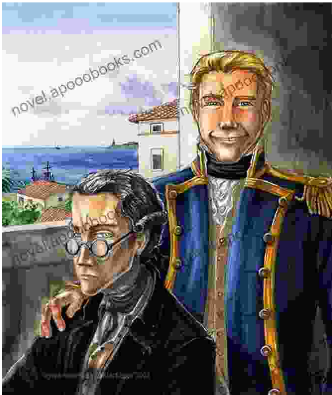
Surgeon Stephen Maturin: The Mind and Heart of the HMS Surprise

Captain Jack Aubrey is the larger-than-life protagonist of the Master and Commander series. A brilliant naval strategist and a fearless leader, Aubrey embodies the spirit of the Royal Navy. With his infectious enthusiasm and unwavering optimism, he inspires loyalty and admiration from his crew.