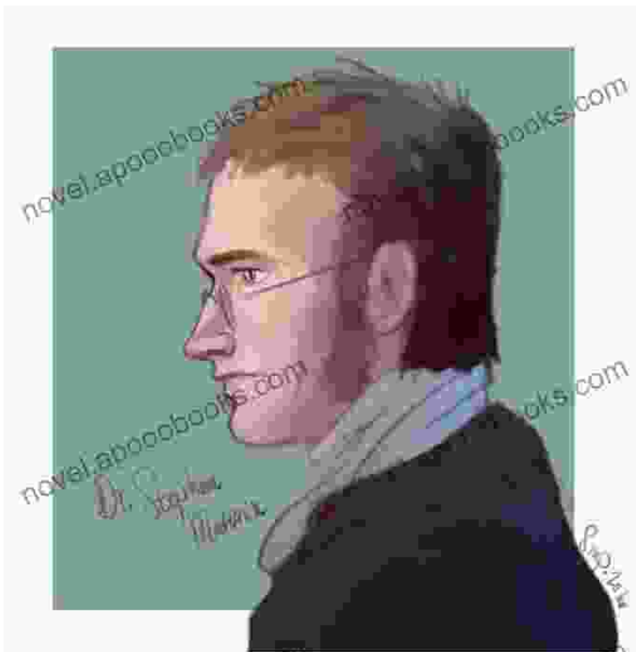
Maturin, a man of science and adventure.

Stephen Maturin, the ship's surgeon, is a man of many talents. Not only is he an expert in medicine and natural history, but he also possesses an insatiable curiosity that leads him into dangerous and intriguing adventures. Maturin's keen intellect and resourceful nature make him an invaluable ally to Aubrey.