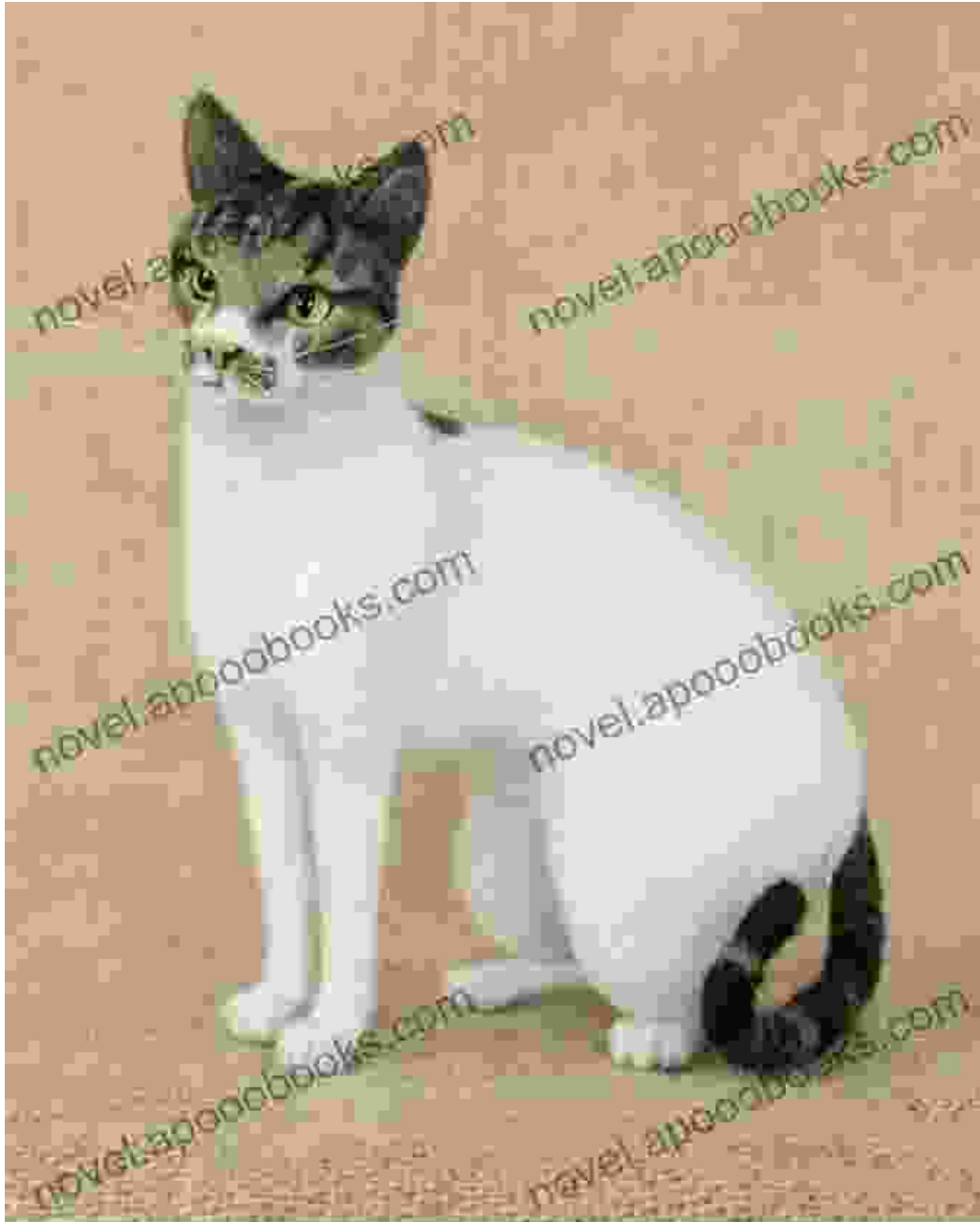
Adorable felted cat sculpture showcasing the versatility of felting