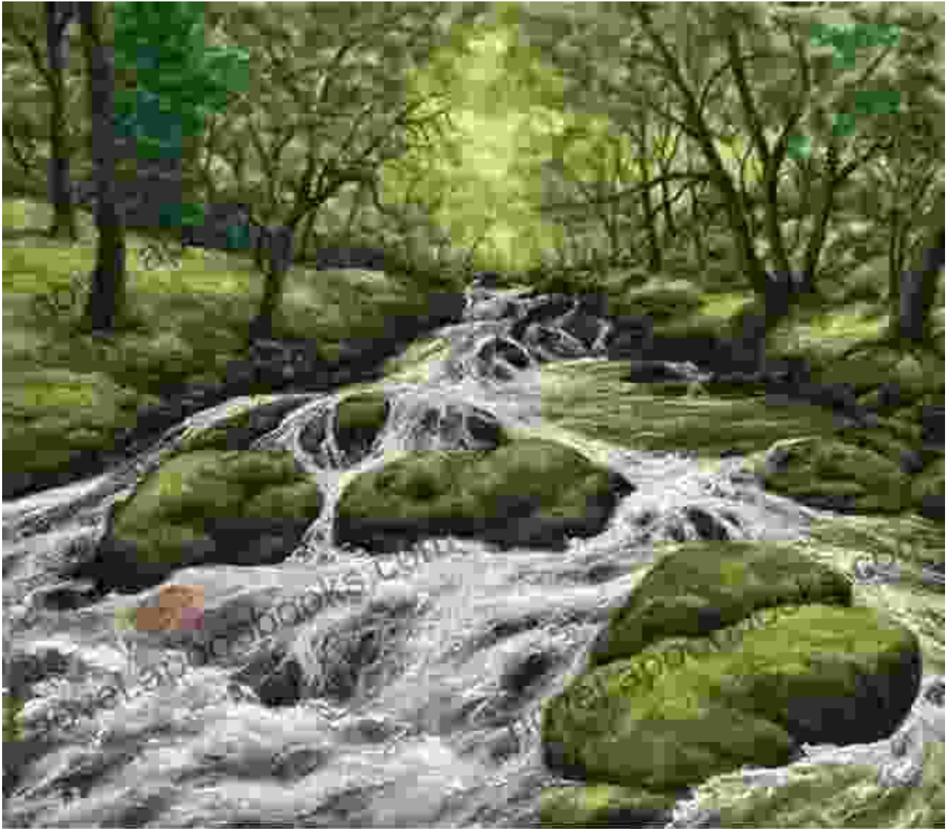
Felted landscape depicting the beauty of nature